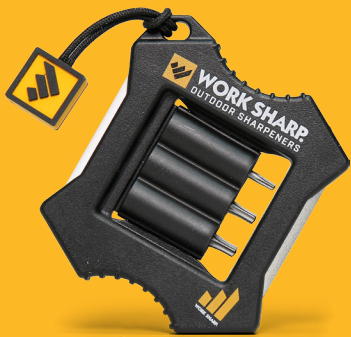
MICRO SHARPENER & KNIFE TOOL

Let's face it: Sharpening your scissors, pocket knife or even kitchen knives is not a common routine in your life. But it should be. Work Sharp has worked hard to make sharpening your tools easier. Since its inception in 2006, this upstart Oregon company has been on the cutting edge of the sharpening industry. After using Work Sharp tools, it's clear that no other sharpeners deliver the same value or ease of use as Work Sharp sharpeners. Now, they've changed the game once again, launching an all-new line of innovative sharpening products. These tools—like the Pivot Plus Knife Sharpener and the Micro Sharpener and Knife Tool—bring a whole new meaning to “working sharp” while continuing to deliver the quality, performance and innovation people have come to expect from Work Sharp.