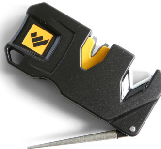
PIVOT PLUS KNIFE SHARPENER

The MICRO SHARPENER & KNIFE TOOL, an ultralight, compact sharpener, fits perfectly into your pocket, pack or gear bag. The Micro's angled-guided medium-grit diamond and fine-grit ceramic rods quickly restore a sharp edge to any knife. The ultra-compact size makes this possible anywhere. The Micro Sharpener allows you to tighten down any loose knife hardware, like pocket clips or handle scales with T6, T8 and T10 drivers, while keeping your blade honed to make quick work of cardboard boxes, blister packs or whatever else you're tackling in a day's work.